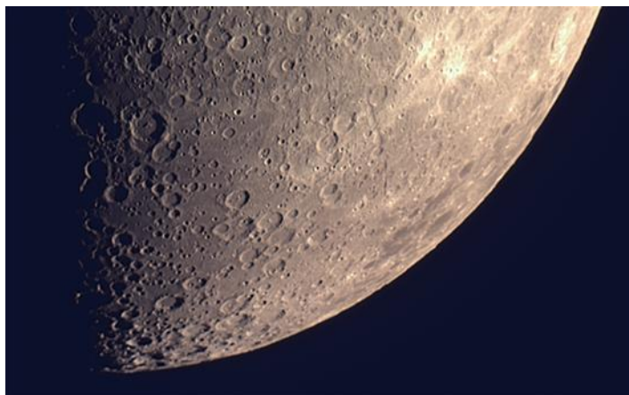
Mare Australe region taken by Club member.