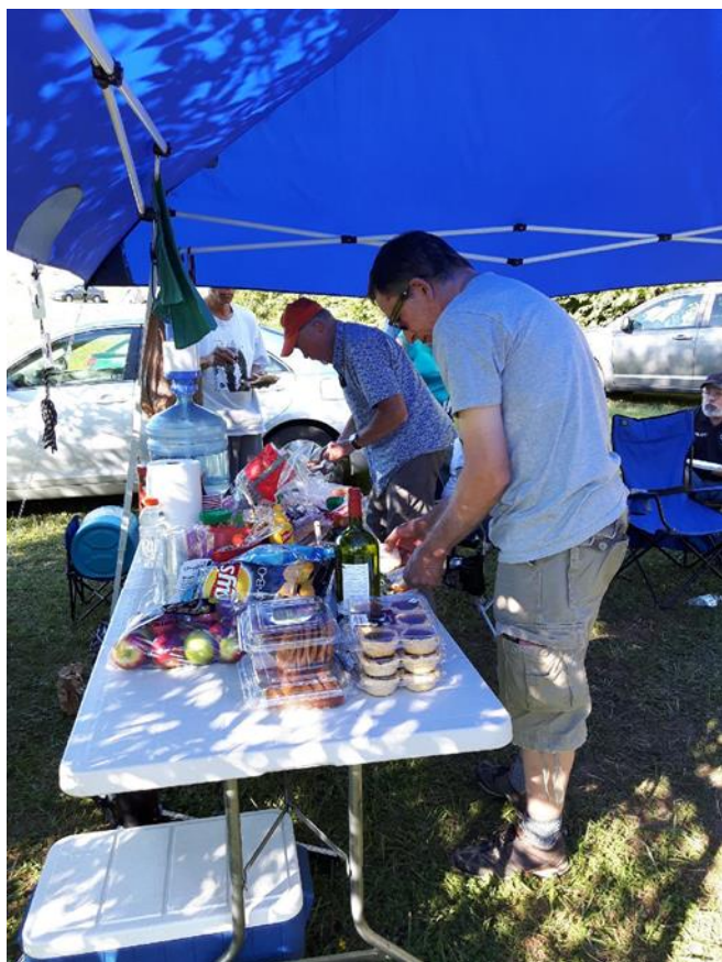
RASC Belleville's potluck dinner on Friday.