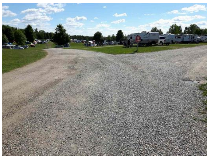
River Place Park, Ayton.