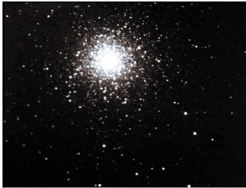
M13 A globular cluster in the Constellation of Hercules

RASC is Canada's leading astronomy organization bringing together over 5,000 enthusiastic amateurs, educators, and professionals.