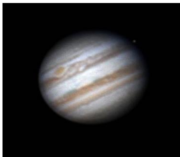
Jupiter with the Great Red Spot

Through the RASC there are many avenues open for you to share your interest in astronomy with people across the country and throughout the world.